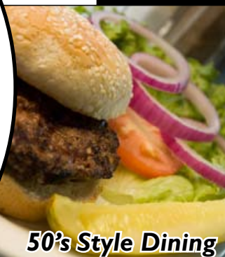
50's Style Dining

PHONE 660-284-6371 www.heartland-ministries.org www.heartlandfordmuseum.com